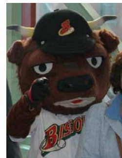
Buffalo Bison mascot attends press event.